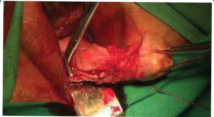
Figure 1 Surgical procedure of vagina.

noninvasive pre-birth tests ought to be made accessible for screening other chromosomal variations from the norm and neural tube deformities. Endometrial malignancy is the fourth most normal reason for growth among ladies in the United States (U.S.) [1]. It is evaluated that in 2012, more than 47,000 ladies living in the U.S. will be analyzed with endometrial malignancy and more than 8,000 ladies will bite the dust from this sickness of which a greater part of cases will be endometrial tumor [2].