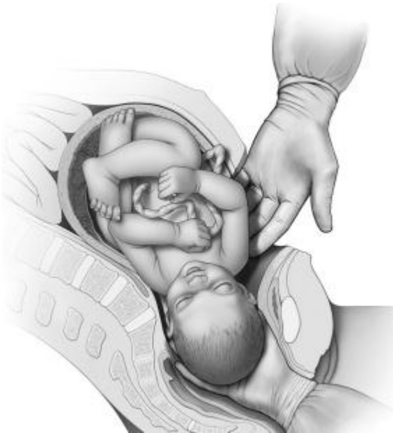
Figure 2: The Hand Push Disengagement Technique.